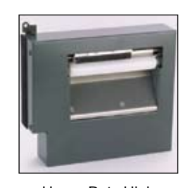
Heavy Duty High Throughput Cutter