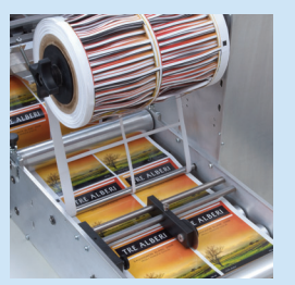
Removal of waste matrix