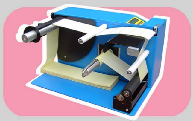
Dispenser with fanfold accessory

Big Electronic Dispenser Series is the ideal solution for your label handling operations like the food packaging sector. Our dispenser can be used with both roll of labels and fanfold through the optional fanfold accessory. Versatile, simple to use, reliable and tough, our big electronic dispenser will make it easy for you to apply labels in your manufacturing process. Available in two different versions: the model DN 01 can handle labels up to 150 mm wide, while the model DN 02 is able to handle labels up to 210 mm wide! All the other features are common to both models.